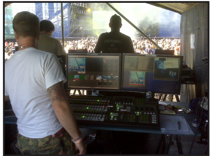
CT Rig on World Tour with the band REM, Argentina

Slate is a live integrated production system, with switcher, HD clip and graphic stores, Inscribe CG, comprehensive multi-view, Fluent workflow software, aspect conversion, and multi-definition format conversion. Fluent streamlines production workflow by integrating video, files and data. Fluent Watch-Folders gracefully import clips and graphics from the rest of your studio. Slate saves 70% of the cost of a conventional control room, and saves even more on staffing, as a single operator can create compelling live video. Slate saves again when it easily upgrades to 3G 1080p, the future of HD production. Join over 1,200 studios, in over 70 countries that use Broadcast Pix systems.