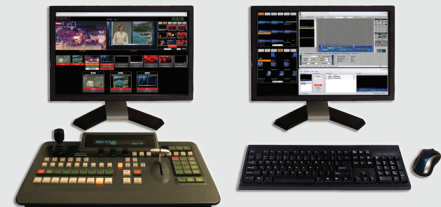
Slate 1000, 2100, 3000